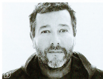
Philippe Starck for Cassina

standout The designer's 2007 hit gets a workplace twist with a tulip or four-spoke swivel base, matte-finish shell, and quilted or smooth padded upholstery. cassina.com . circle 256